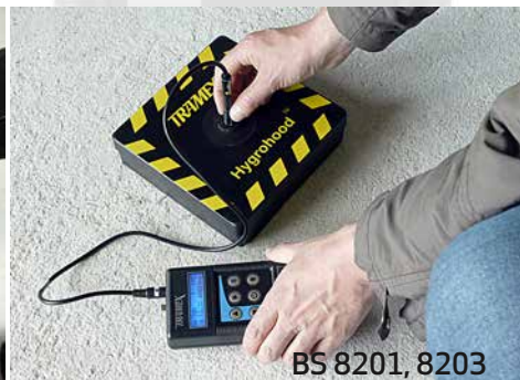
BS 8201, 8203