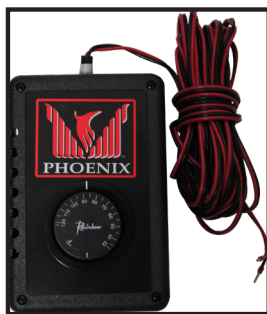
Included remote thermostat