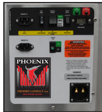
2-8.5 amp circuits Up to 3,960W (13,503 BTUs)