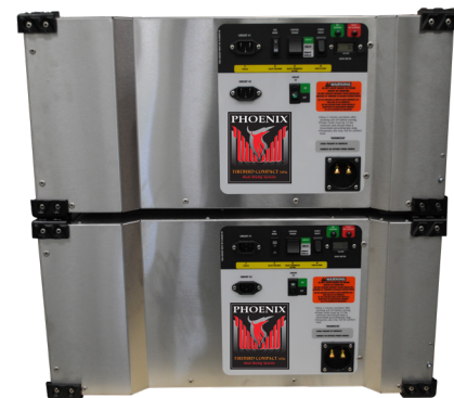
Stack up to 6 units with a strap for storage and transportation