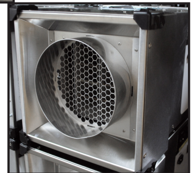
Ductable 8" outlet