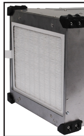
Mini Pleated MERV-11 filter